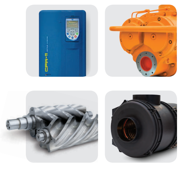
Every Sullair VOC/VSD has ease of servicing built in and is backed by a range of genuine spare parts and full factory warranty.