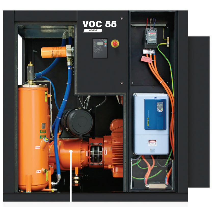
Sullair's proven air end with the highest efficiency at different loads

The Australian designed Sullair VOC/VSD combines two technologies that can save you thousands of dollars in energy costs per annum. Reduce your carbon footprint and save money with Sullair VOC/VSD.