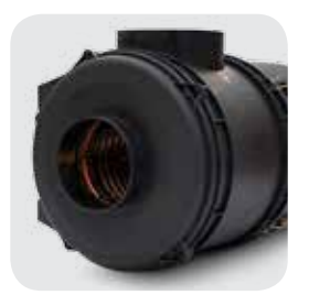
Every Sullair CSA/VSD has ease of servicing built in and is backed by a range of genuine spare parts and full factory warranty.