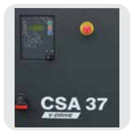
Electronic Control Panel